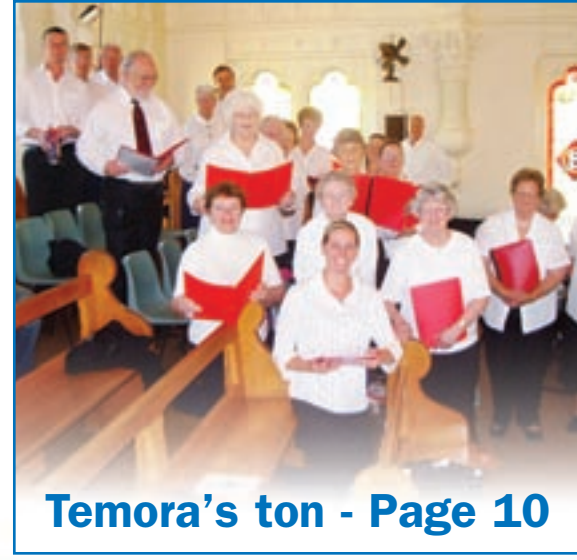
Temora's ton - Page 10